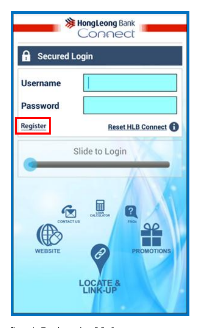
Step 1: Registration Mode